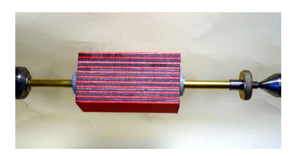
Apply a finish to your duck call, here I use Odie's Oil which is food safe

Use a blank of your choosing 1 \frac{1}{2} " x 1 \frac{1}{2} " x 3" and mount it on the Duck Call Tooling kit.